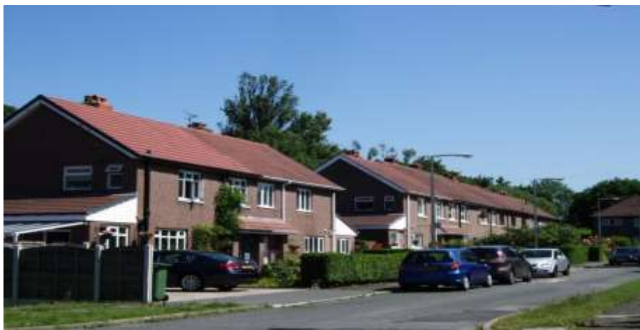
1960s-1970s semi-detached housing