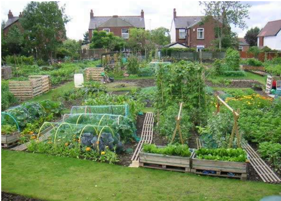
High Lane Village allotments