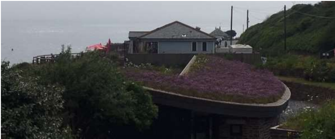
Sedum Roof on a Sustainable House

New development should aim to maximise energy and resource efficiency in new buildings and conversions. This should be achieved through the following: