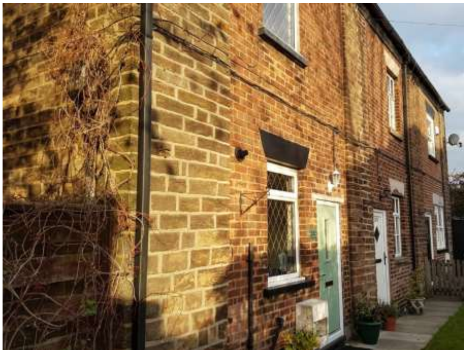
Typical stone/ brick cottages of the village