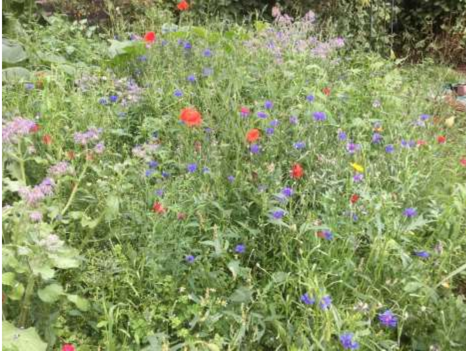
Wildflower meadow in a Domestic Garden

All developments should mitigate the impact from the loss of countryside, wildlife and the natural environment.