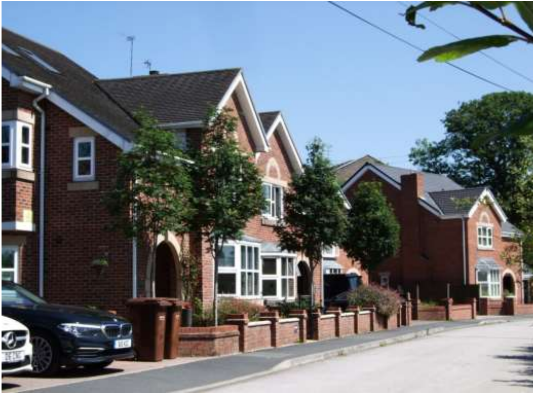
Early 21 st Century Housing