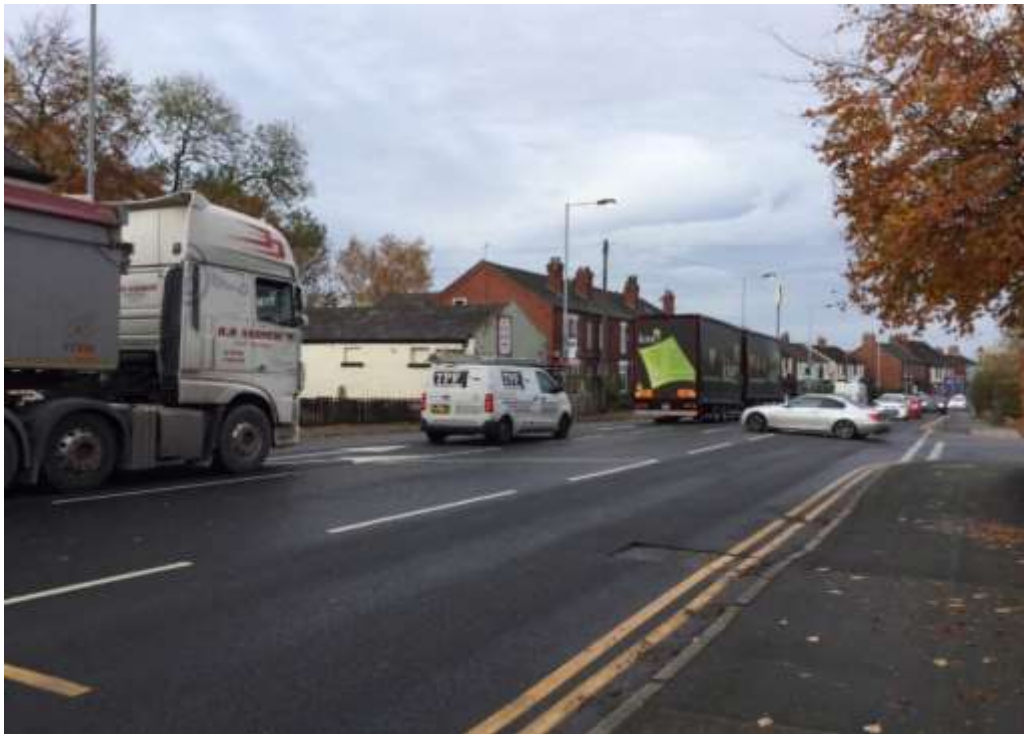
Heavy Traffic on A6 Corridor - Village Centre