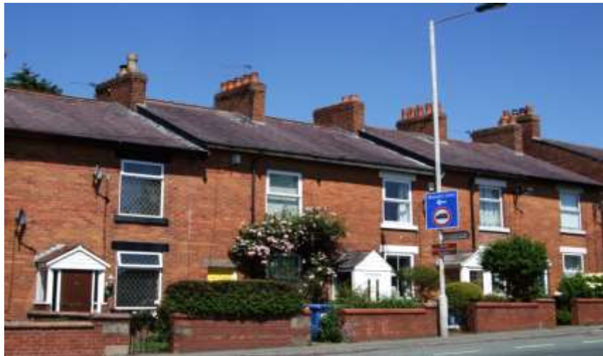
Middlewood View cottages on A6 in High Lane